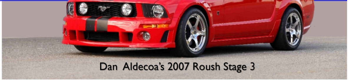
Dan Aldecoa's 2007 Roush Stage 3