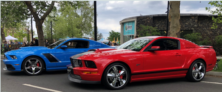
Lilac Royalty took time to check out the Cruzin' the Falls Car Show, and get a few photos with the vehicles